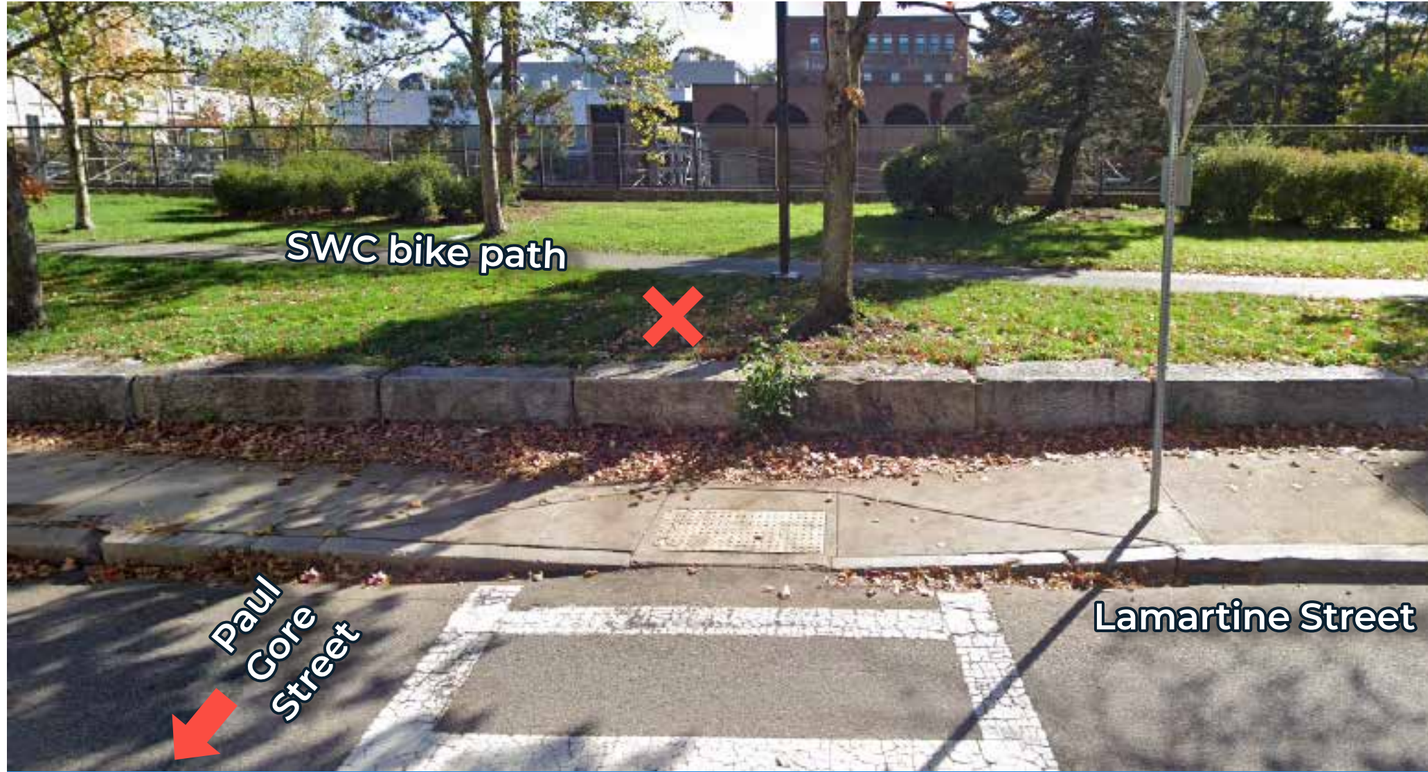
There's no ramp to the Southwest Corridor bike path from Paul Gore Street.

People are already biking both ways on Boylston Street. 1 in 5 bicyclists ride contraflow near Danforth Street, the block approaching the Southwest Corridor.