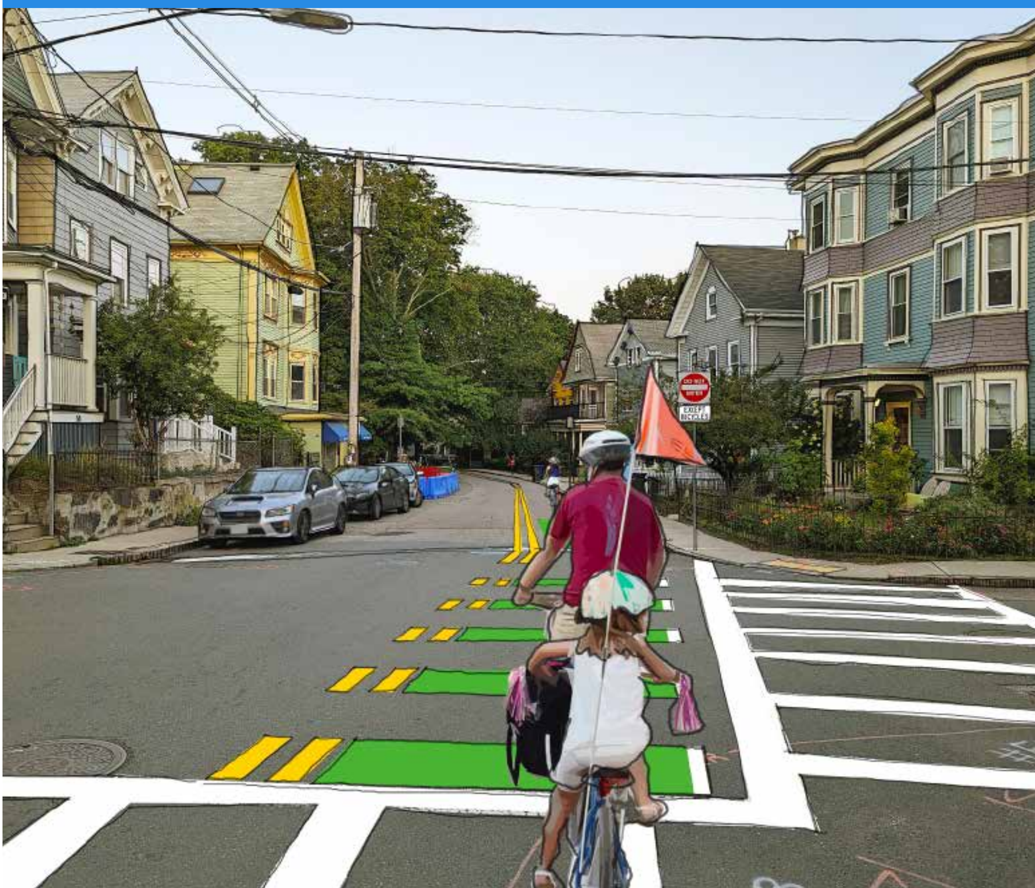
Artistic rendering of Boylston Street with a contraflow bike lane.

Vehicle volumes are moderate. We can make the street safer and more comfortable with speed humps.